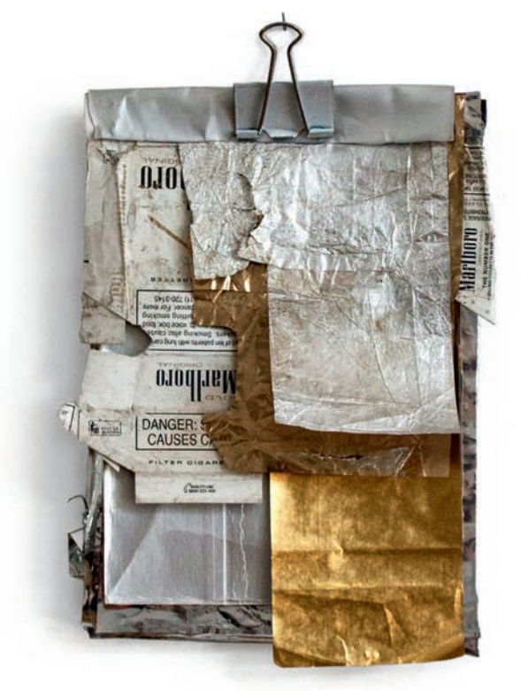
Figs 3a & b. Kai Lossgott, Waste Books: a series of experiments in re-animating industrial and post-consumer waste through manual labour (2013 - present). Recycled teabags on paper (left) and various recycled materials (right).