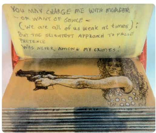
Figs 2a, b, c & d. Diane Victor. The Hunting of the Snark, 2010. Recycled GUD VW Fox air filter and mixed media.